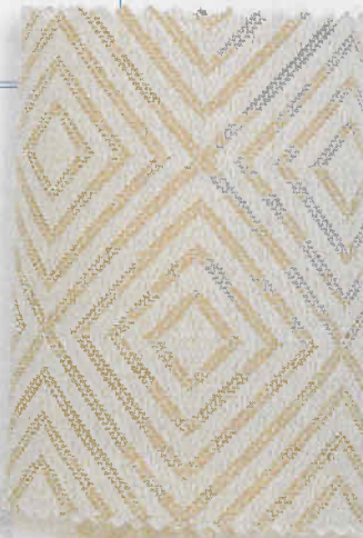
KORFU A geometric that will stay crisp and clean—it's stain-, odor-, and germ-resistant. Acrylic, shown in Cameo. CRYPTON: cryptonfabric.com.