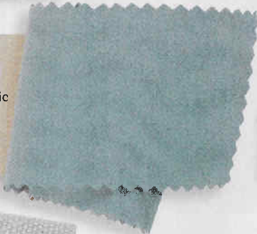
ULTRASUEDE GREEN Ultrasuede has always been a go-to for high-traffic upholstery. Now it's eco-friendly, too. Recycled polyester, shown in Pool. KRAVET: kravet.com.