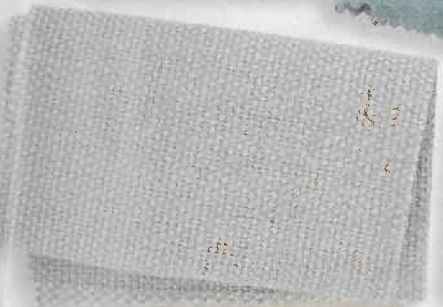
SHAKER A special "wet spinning" process adds strength and softness to this linen. It will never pill or fray. Linen, shown in Bantu. ROGERS & GOFFIGON: 203-532-8068.