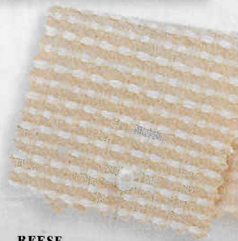
REESE Built to withstand sun, snow, and anything you might spill. Solution-dyed acrylic, shown in Parchment. SUNBRELLA THROUGH SILVERSTATE FABRICS: silverstatefabrics.com.