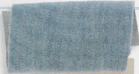
VENETO So soft, you may want to pet your sofa. Alpaca, wool, acrylic, shown in Laguna. PHILIP GORRIVAN FOR HIGHLAND COURT: highlandcourtfabrics.com.