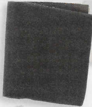
NIGEL This velvet mohair may seem delicate, but it's made from rugged goat-hair fibers. Mohair, shown in Clay. RALPH LAUREN HOME: ralphlaurenhome.com.