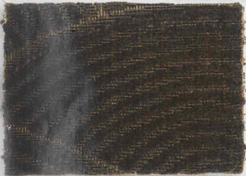
STONEWEAVES A sculptured velvet is a great choice if you want textural pattern and durability. Cotton, polyester, shown in Walnut. BARRY DIXON COLLECTION FOR VERVAIN: vervain.com.