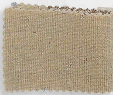
POINTE The tiny loops in this tightly woven épinglé look refined and tailored. Wool, shown in Platinum. J. ROBERT SCOTT: jrobertscott.com.